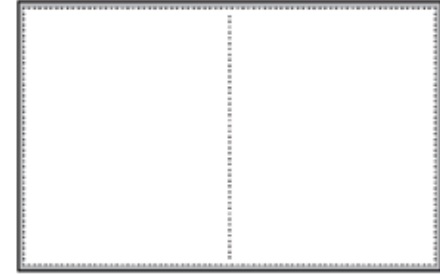
2-Page Spread Non-Bleed Only

11661 San Vicente Blvd., Suite 709 | Los Angeles, CA 90049